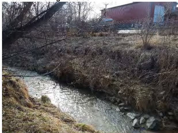
Photo 3 - Existing Condition