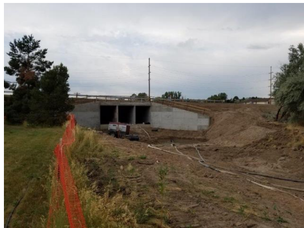
Photo 4 – Connection to the Antelope Creek Box Culvert under Arapahoe Road